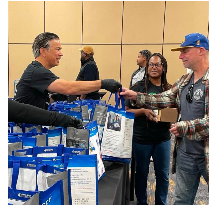
Charity Press Conferences and Volunteering