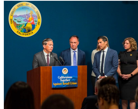
AG at the State Capitol