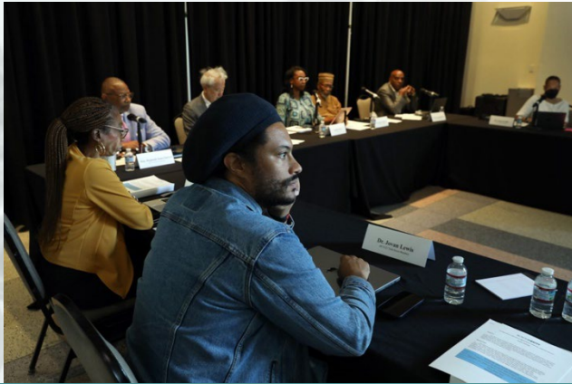
Reparations Task Force