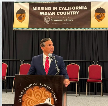
Missing and Murdered Indigenous Persons Event