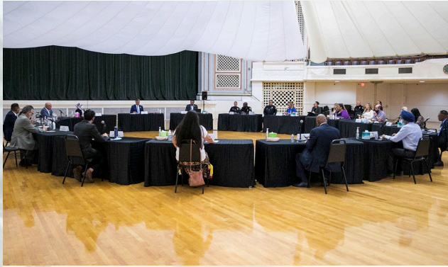
Hate Crimes Roundtables