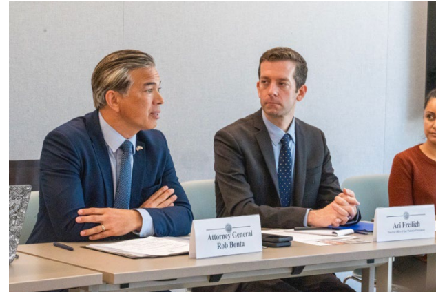
Office of Gun Violence Prevention