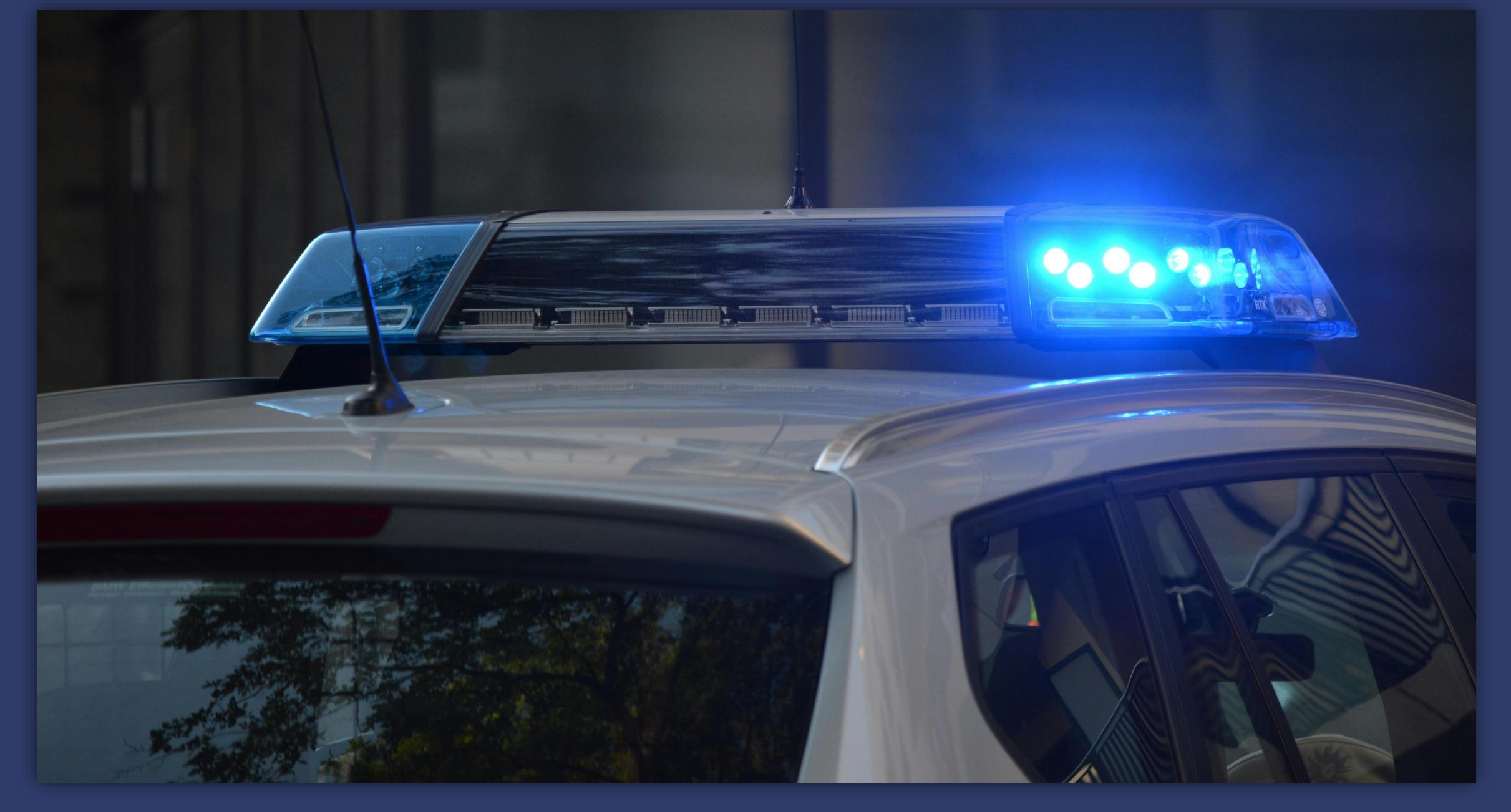
Police Executive Research Forum