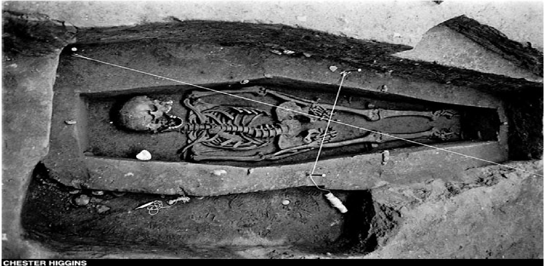
Figure 1. Remains of Enslaved African at African Burial Ground, NYC